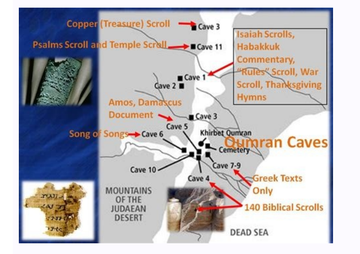
Copyright © 1978, 1996, 2009 by Charles R. Swindoll, Inc. All rights reserved worldwide.